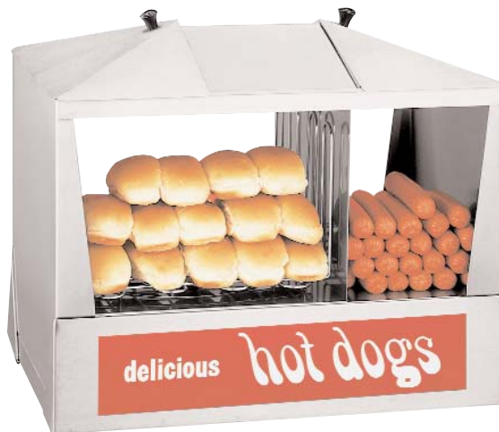
Model 35SSC Customer Side