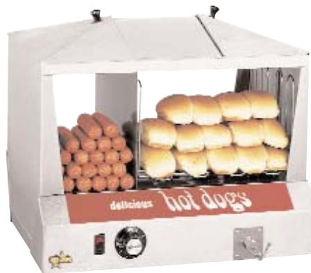
Model 35SSC Operator Side

Classic Steamro Jr. hot dog steamer is covered by Star's one year parts and labor warranty.